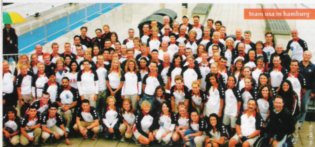
team usa in hamburg